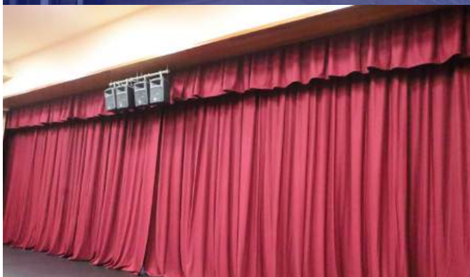
Francis Hodgkinson Theatre