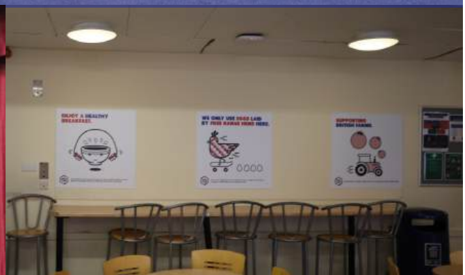
Green Dining Room